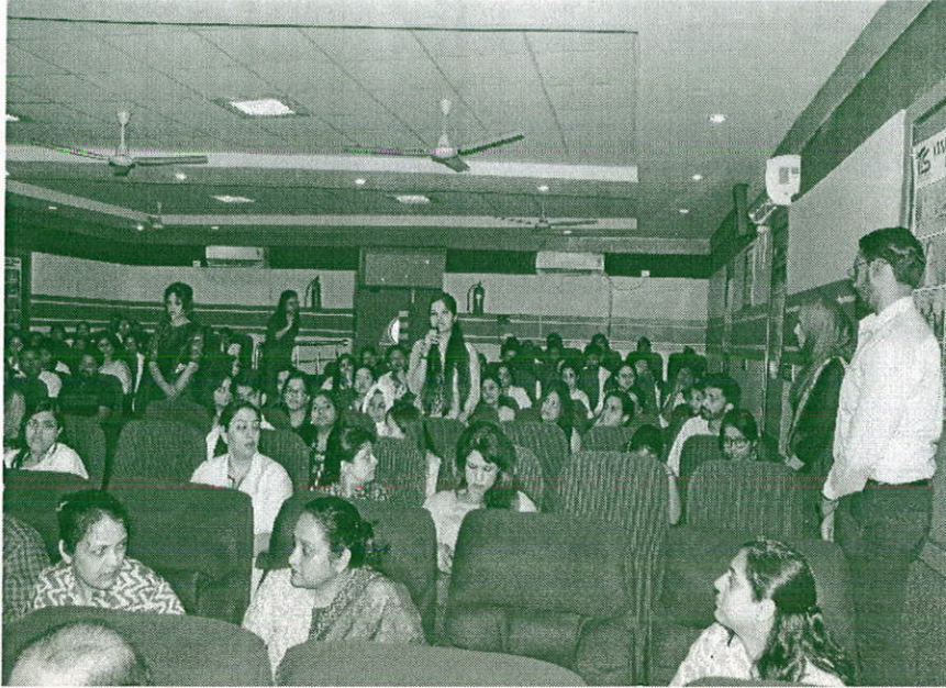
Student interaction with the chief guests